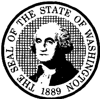
Kim Wyman, Secretary of State

Given under my hand and the Seal of the State of Washington at Olympia, the State Capital