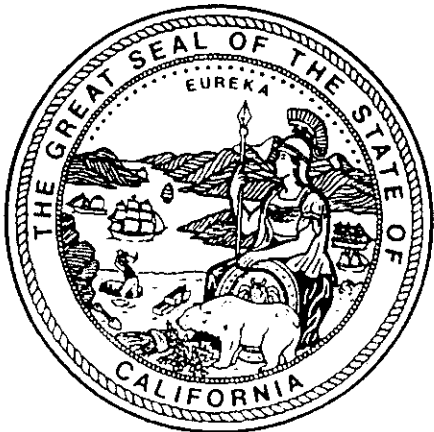
BRUCE McPHERSON Secretary of State

IN WITNESS WHEREOF, I execute this certificate and affix the Great Seal of the State of California this day of May 16, 2005 .