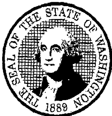
Kim Wyman, Secretary of State

Given under my hand and the Seal of the State of Washington at Olympia, the State Capital