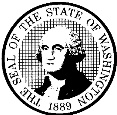
Kim Wyman, Secretary of State

Given under my hand and the Seal of the State of Washington at Olympia, the State Capital