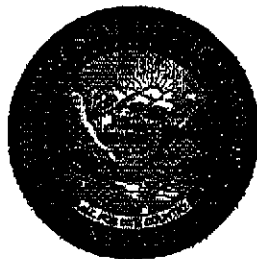
Barbara K. Cegavske Secretary of State

Electronic Certificate Certificate Number: C20170901-0029 You may verify this electronic certificate online at http://www.nvsos.gov/