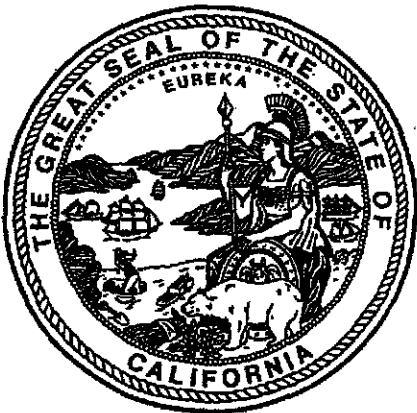
ALEX PADILLA Secretary of State

IN WITNESS WHEREOF , I execute this certificate and affix the Great Seal of the State of California this day of November 2, 2017.