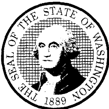
Kim Wyman, Secretary of State

Given under my hand and the Seal of the State of Washington at Olympia, the State Capital