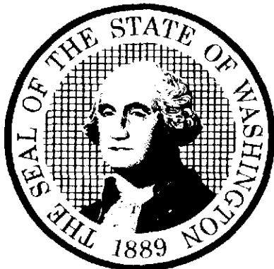
Kim Wyman, Secretary of State

Given under my hand and the Seal of the State of Washington at Olympia, the State Capital