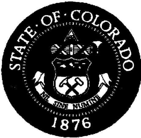
Secretary of State of the State of Colorado

I have affixed hereto the Great Seal of the State of Colorado and duly generated, executed, authenticated, issued, delivered and communicated this official certificate at Denver, Colorado on 04/03/2015 @ 15:59:19 pursuant to and in accordance with applicable law. This certificate is assigned Confirmation Number 9147148.