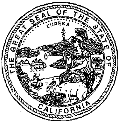
ALEX PADILLA Secretary of State

IN WITNESS WHEREOF , I execute this certificate and affix the Great Seal of the State of California this day of September 28, 2016.