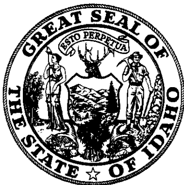
SECRETARY OF STATE