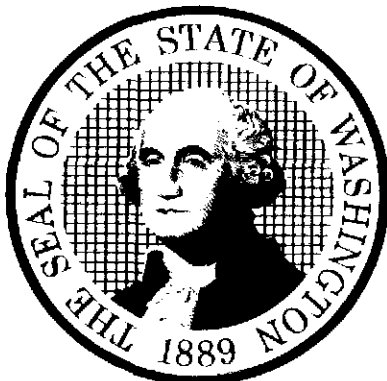
Kim Wyman, Secretary of State

Given under my hand and the Seal of the State of Washington at Olympia, the State Capital