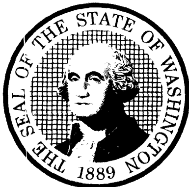
Kim Wyman, Secretary of State

Given under my hand and the Seal of the State of Washington at Olympia, the State Capital