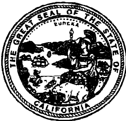
BRUCE McPHERSON Secretary of State

IN WITNESS WHEREOF , I execute this certificate and affix the Great Seal of the State of California this day of June 17, 2005.