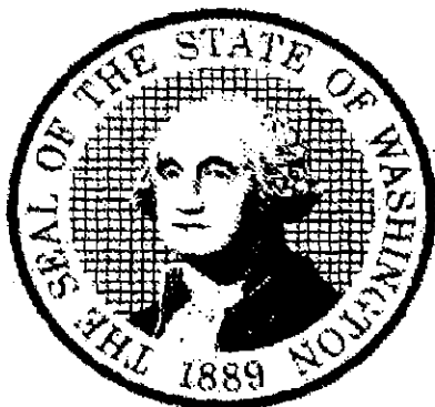
Kim Wyman, Secretary of State

Given under my hand and the Seal of the State of Washington at Olympia, the State Capital