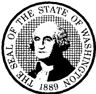
Kim Wyman, Secretary of State

Given under my hand and the Seal of the State of Washington at Olympia, the State Capital