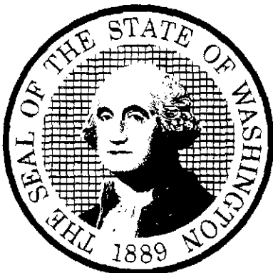
Kim Wyman, Secretary of State

Given under my hand and the Seal of the State of Washington at Olympia, the State Capital