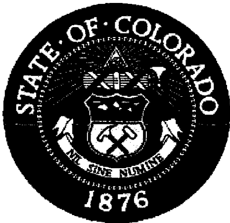
Secretary of State of the State of Colorado

I have affixed hereto the Great Seal of the State of Colorado and duly generated, executed, authenticated, issued, delivered and communicated this official certificate at Denver, Colorado on 09/29/2015 @ 14:33:09 pursuant to and in accordance with applicable law. This certificate is assigned Confirmation Number 9319811.