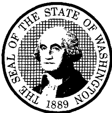
Kim Wyman, Secretary of State

Given under my hand and the Seal of the State of Washington at Olympia, the State Capital