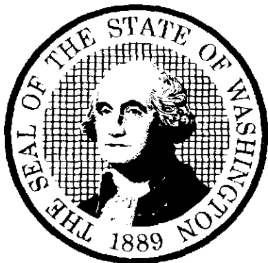
Kim Wyman, Secretary of State

Given under my hand and the Seal of the State of Washington at Olympia, the State Capital