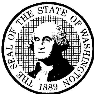
Kim Wyman, Secretary of State

Given under my hand and the Seal of the State of Washington at Olympia, the State Capital