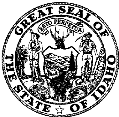
SECRETARY OF STATE