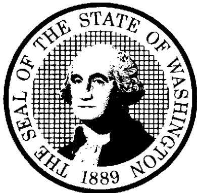
Kim Wyman, Secretary of State

Given under my hand and the Seal of the State of Washington at Olympia, the State Capital