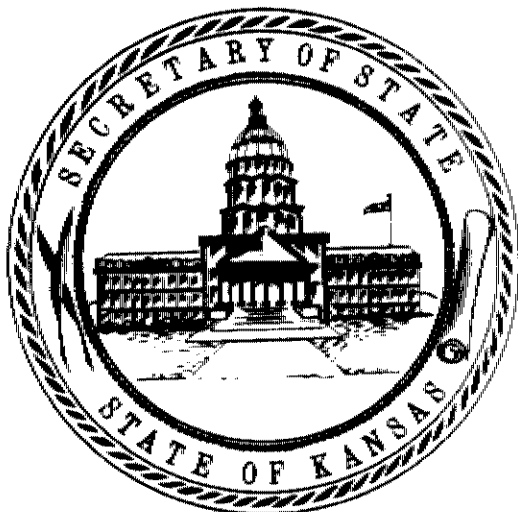
BILL GRAVES SECRETARY OF STATE

I hereto set my hand and cause to be affixed my official seal. Done at the City of Topeka, this 31st day of August, A.D. 1987.