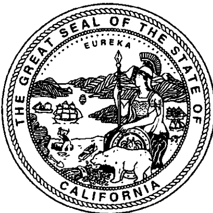
BRUCE McPHERSON Secretary of State

IN WITNESS WHEREOF , I execute this certificate and affix the Great Seal of the State of California this day of January 12, 2006.