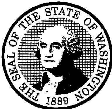
Kim Wyman, Secretary of State

Given under my hand and the Seal of the State of Washington at Olympia, the State Capital