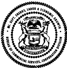
,Director Bureau of Commercial Services