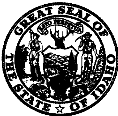
SECRETARY OF STATE