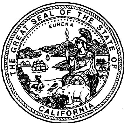
ALEX PADILLA Secretary of State

IN WITNESS WHEREOF , I execute this certificate and affix the Great Seal of the State of California this day of July 6, 2017.