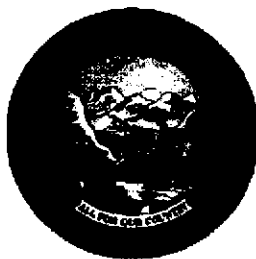
Barbara K. Cegavske Secretary of State

Electronic Certificate Certificate Number: C20170609-0600 You may verify this electronic certificate online at http://www.nvsos.gov/