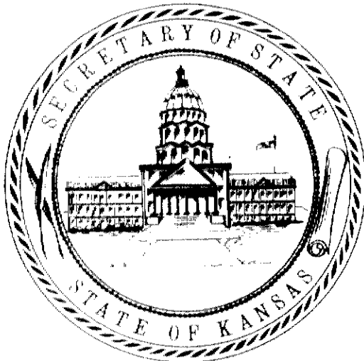
BILL GRAVES SECRETARY OF STATE

In testimony whereof: I hereto set my hand and cause to be affixed my official seal. Done at the City of Topeka, this 7th day of October, A.D. 1991