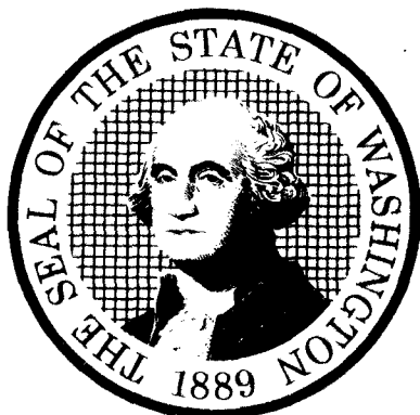
Kim Wyman, Secretary of State

Given under my hand and the Seal of the State of Washington at Olympia, the State Capital