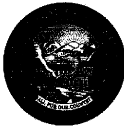
ROSS MILLER Secretary of State

Electronic Certificate Certificate Number: C20100624-0135 You may verify this electronic certificate online at http://www.nvsos.gov/