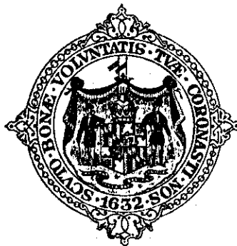
Paul B. Anderson Charter Division

301 West Preston Street, Baltimore, Maryland 21201 Telephone Balto. Metro (410) 767-1344 / Outside Balto. Metro (888) 246-5941 0004561156 MRS (Maryland Relay Service) (800) 735-2258 TT/Voice Fax (410) 333-7097