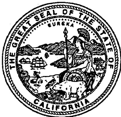
BRUCE McPHERSON Secretary of State

IN WITNESS WHEREOF , I execute this certificate and affix the Great Seal of the State of California this day of July 17, 2006.