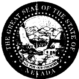
DEAN HELLER Secretary of State

Electronic Certificate Certificate Number: C20061004-1863 You may verify this electronic certificate online at http://secretaryofstate.biz/