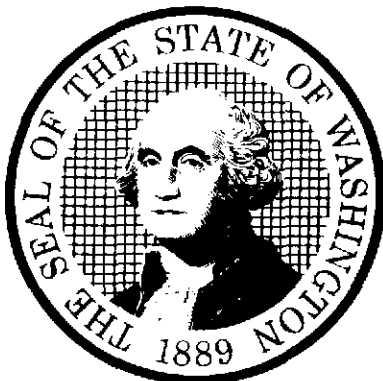
Kim Wyman, Secretary of State

Given under my hand and the Seal of the State of Washington at Olympia, the State Capital